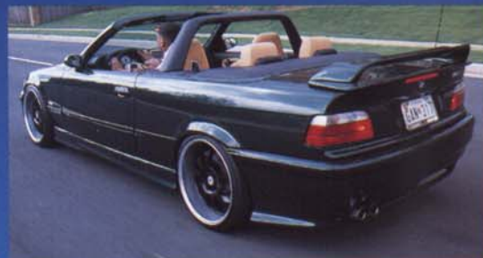
Stunning M3 Convertible

Touring car style for 318iS complete with PS2 and TV